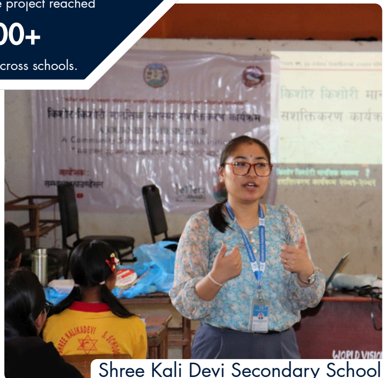
Shree Kali Devi Secondary School