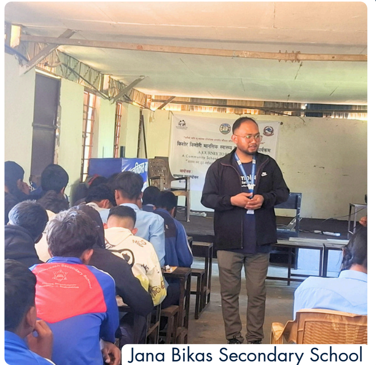
Jana Bikas Secondary School