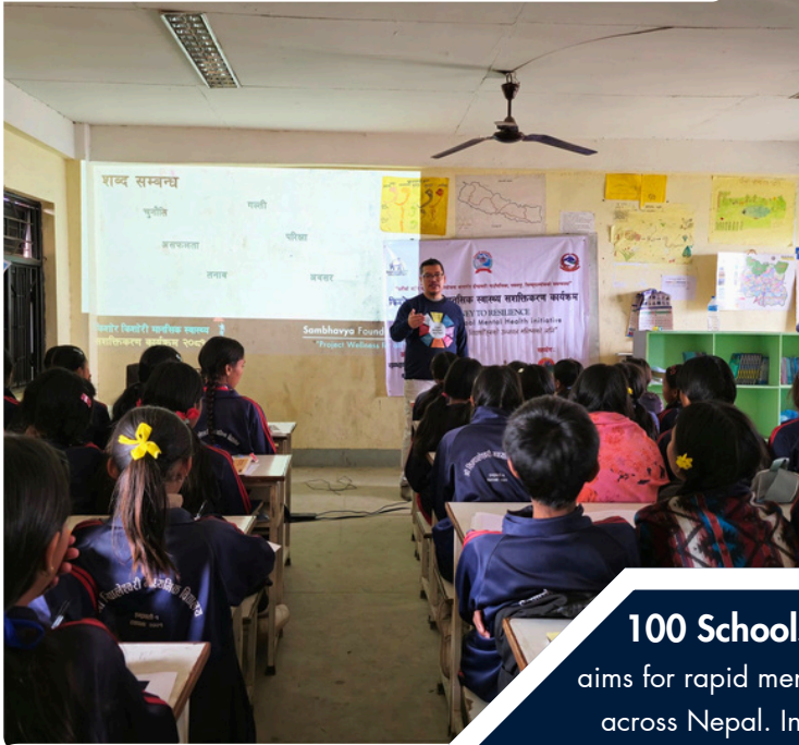
Shree Simpaleshwori Secondary School