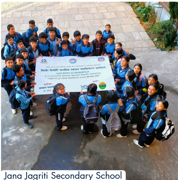
Jana Jagriti Secondary School