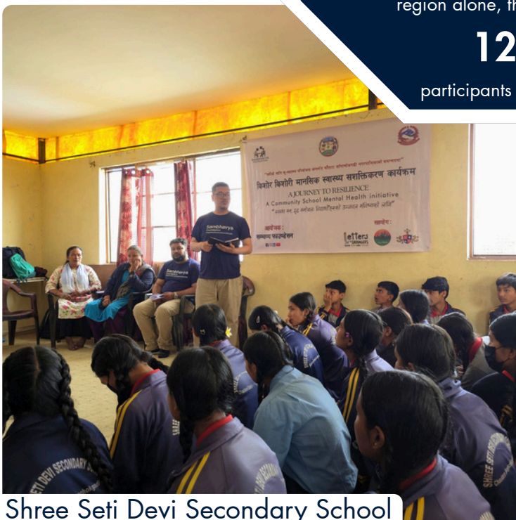
Shree Seti Devi Secondary School